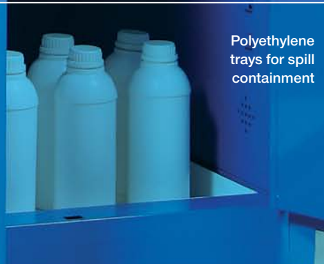
Polyethylene trays for spill containment