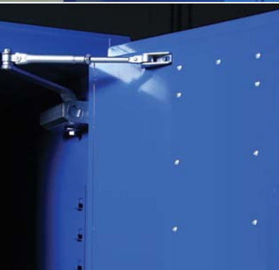
Removable panel to service three point latching mechanism