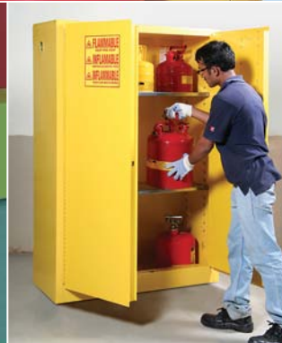
Each door latches open with a fusible link