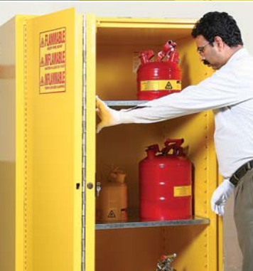
Bi-Fold Self-Closing Doors

FLAMMABLE KEEP FIRE AWAY INFLAMMABLE MANTENGA ALEJADO DEL FUEGO INFLAMMABLE TENIR LOIN DES FLAMMES